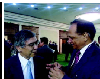
President, Asian Dev. Bank (ADB)