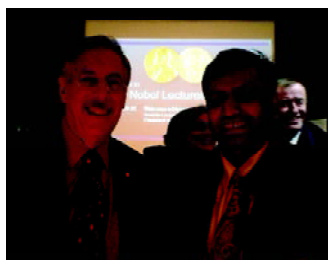
Our VC with Prof. Peter A. Diamond, (Nobel Laureate), MIT, USA