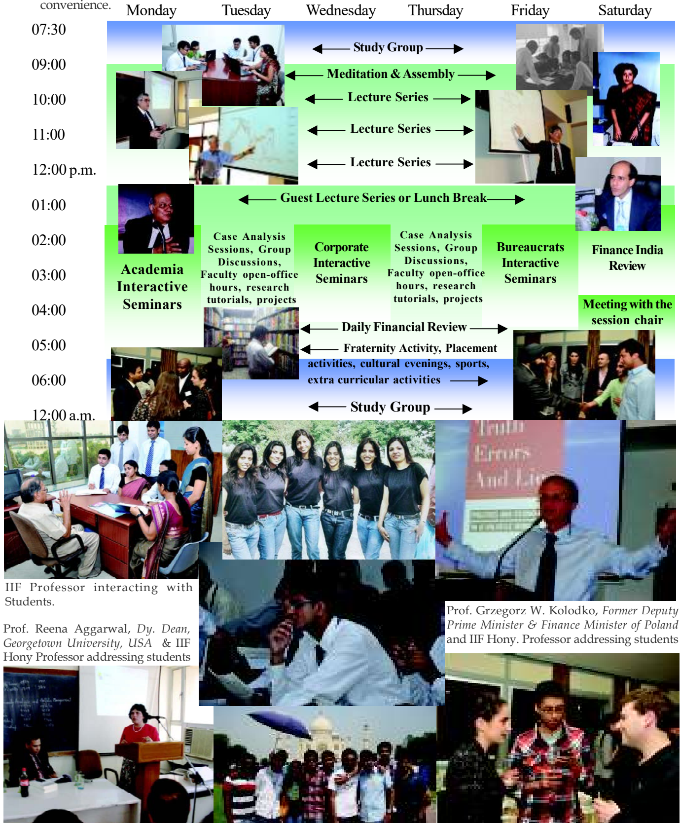
IIF Professor interacting with Students.

Students spend between three to four hours preparing for each of the next day's lectures. Study groups, which enhance and supplement individual lecture preparations, typically meet daily and as per their need and convenience.