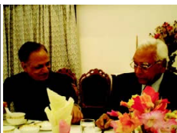
the then Governor of Haryana & Delhi